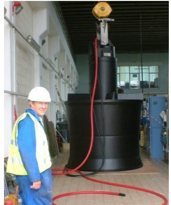
Bedford Pumps' Storm Pump for Altmouth P.S.

A number of different pumping configurations were considered during the outline design stage including replacing the existing Vickers pumps with three Storm Pumps operating at 15m 3 /s each at approximately 4.7m head. Bedford Pumps made a significant contribution to the station design by suggesting, and going on to supply, four pumps instead of the three, thus reducing the total head from 4.7m to 4m and subsequently saving 600kW on the installed power. The addition of a fourth pump would reduce the required flow per pump to 11.25m 3 /s.