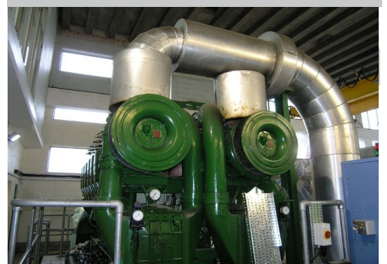
Original diesel engine driving the pumps