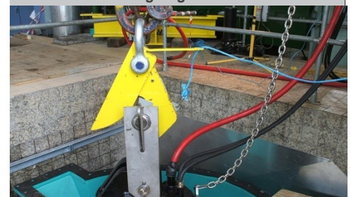
Unique latchlift system