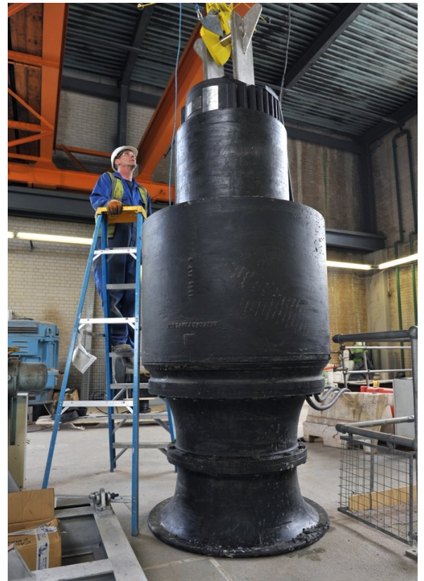
Bedford Pumps' Storm Pump for Ashton Avenue

Bedford Pumps are delighted to have been part of such a worthy project which was completed ahead of schedule and under the original budget.