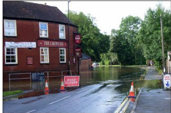
Flooding in the village of Kempsey

Bedford Pumps' new SAF Range of Fish Friendly pumps have undergone rigorous tests by VisAdvies BV, an independent research consultancy in the field of water management