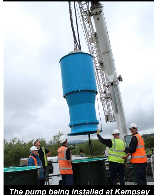
The pump being installed at Kempsey