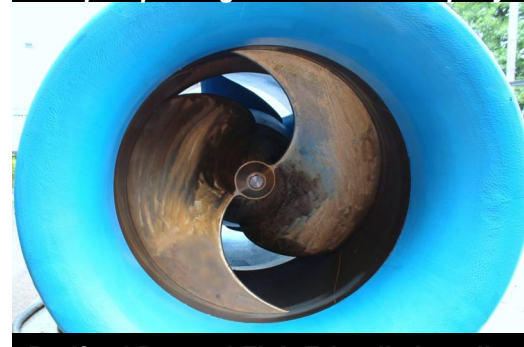
Bedford Pumps' Fish Friendly Impeller