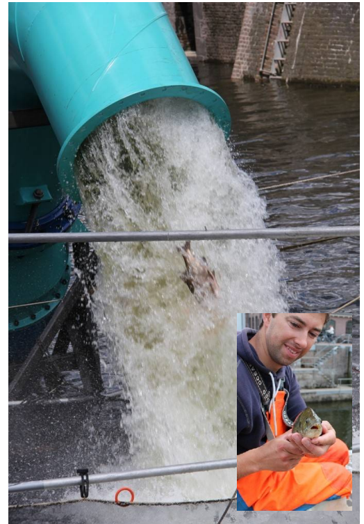
Bedford Pumps SAF Pump on trial