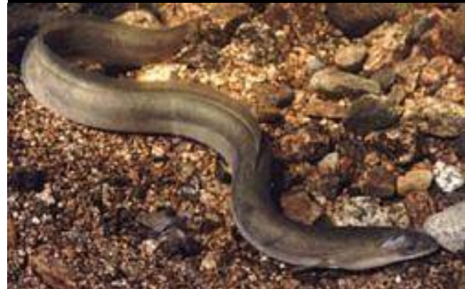
"EU Eel Regulations" require measures to reduce eel mortality