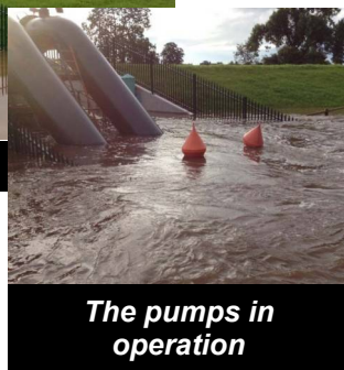
The pumps in operation