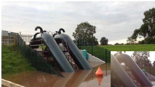
Outfall pipes at Kempsey

Bedford Pumps' standard SAF range of Fish Friendly pumps cover from 400 to 7,000 l/s at 2 to 6m head and are ideally suited for Land Drainage, Flood Defence and Fish Farm applications. Larger capacity pumps can also be designed to meet specific requirements.