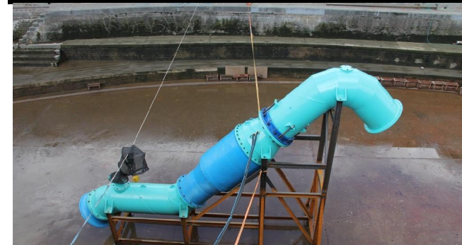
Test rig assembled in a dry dock in Holland