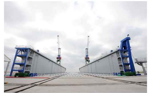
The floating dock in Azerbaijan

Bedford Pumps was formed in 1987 by members of the Pump Department at NEI (W H Allen) after the company closed their pump manufacturing facility within the town. W H Allen was founded in London in 1880 and moved to Bedford in 1894 and as Allen Gwynne Pumps established a worldwide reputation for delivery high quality pumping plant to the world market. The fledging company originally called The Bedford Pump Company started with no order book and within 6 years had raised their turnover to £7.5M. They became Bedford Pumps Ltd in 2002 after they were acquired by Hidrosta AG and to this day are a flexible, highly experienced British manufacturer of robust, pumping plant for the water and waste water industry.