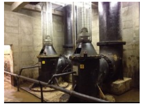
Fig 2. Original pumps from Allen Gwynnes