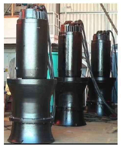
Fig 3. Bedford Pumps replacement pumpsets