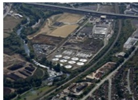
Fig 1. Blackburn Meadows WWTW

Bedford Pumps worked in close collaboration with ETM (j.v. Aecom & Galliford) to overhaul the Don Valley site. Yorkshire Water state that this investment will “treat more waste water, more efficiently and to a higher standard”.