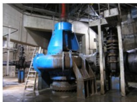
Fig 2. Original pumps